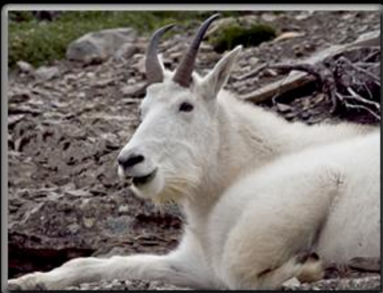
IMG 2131 by Jim Spaniol