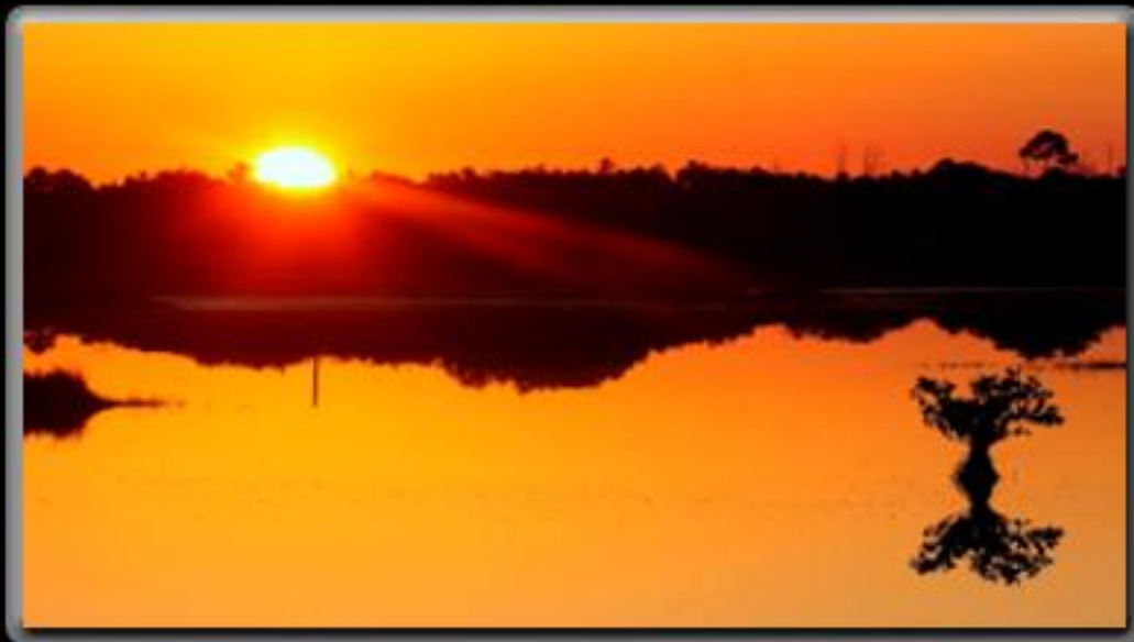
Merritt Island Sunrise