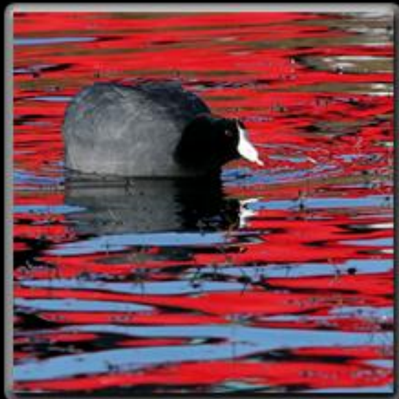
Honors - American Coot by Don Chamberlain