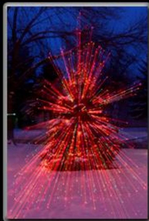
Accepted - Christmas Tree by Eldon Muench