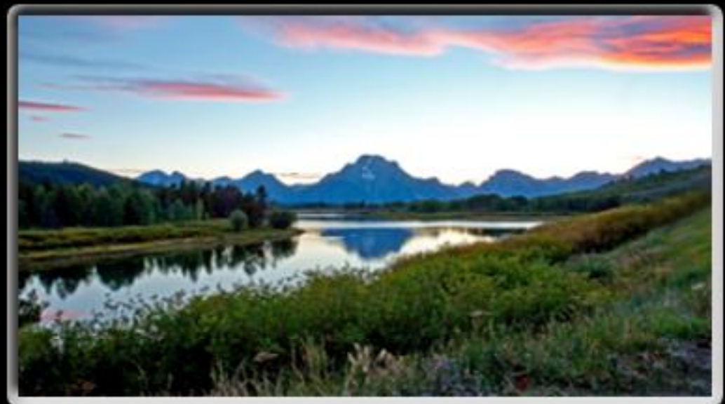
Mount Moran by Virginia Kickle