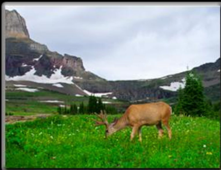
IMG 8359 by Jim Spaniol