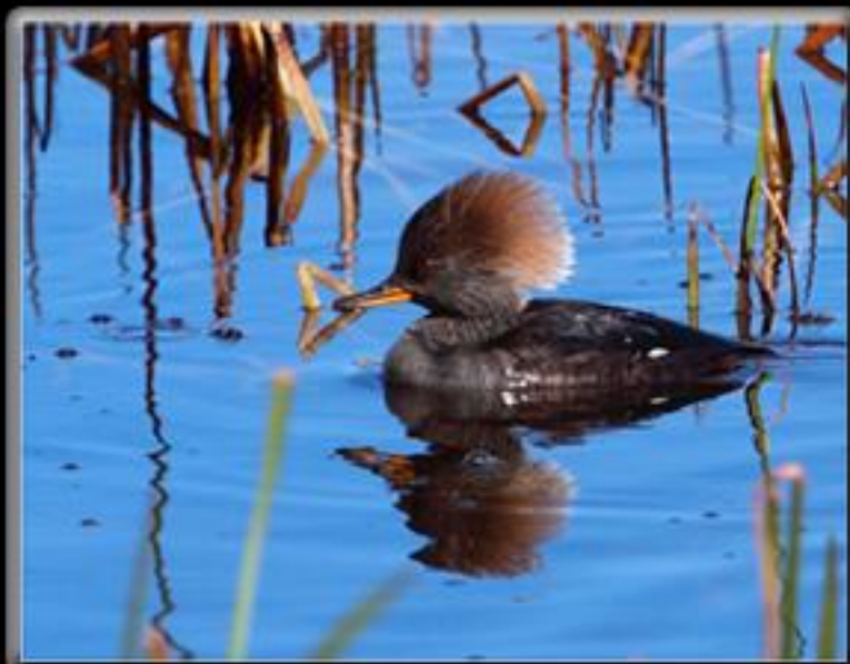
Female Hooded Merganser by Don Chamberlain