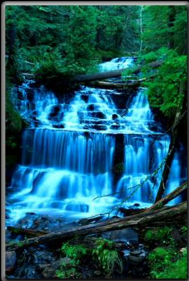
Waterfall by Eldon Muench