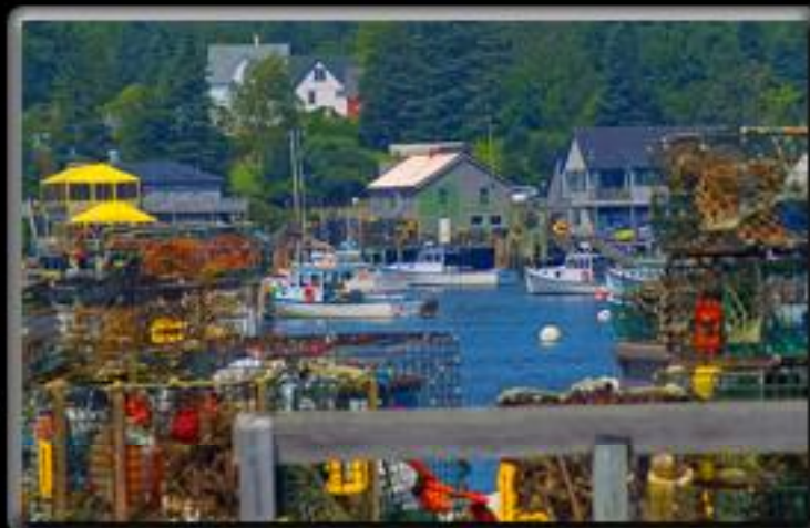
Accepted Harbor Town by Curt Knapp